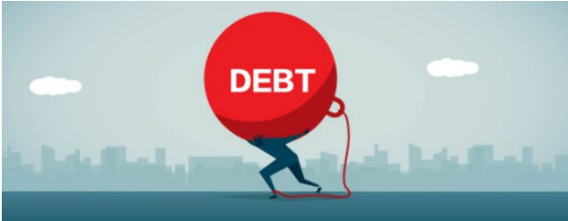
“DEBT & MORTGAGE STRESS”