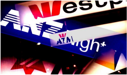
“ADVICE IS NOT A PRODUCT”